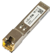
RJ45 SFP copper module